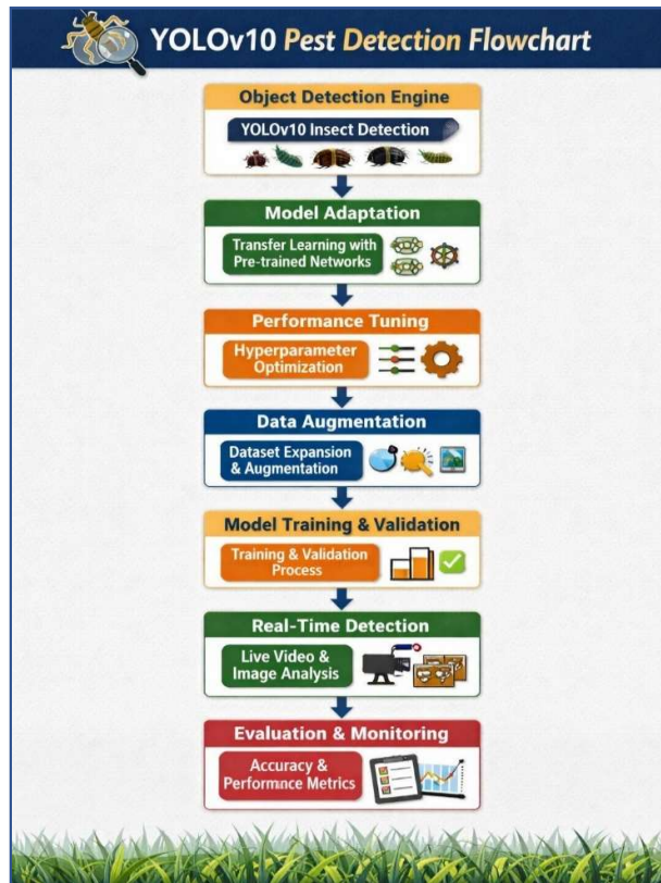
Fig. YOLOv10-based pest detection system flowchart.