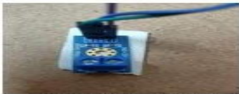
Fig 9. Voltage Sensor

The voltage sensor module (fig 9). It relies on a simple resistive voltage divider to step down input voltage. This brings high voltages into range for the ADC's 5V max, supporting inputs up to 25V safely. For best results and safety, stick to 0-25V. It's very simple to