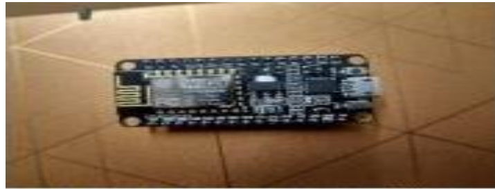
Fig 8. ESP8266

The ESP8266 (Fig 8). It runs on a 32-bit Tensilica L106 CPU that clocks up to 160 MHz for smooth performance, with 32KB of internal RAM for fast data processing and support for up to 16MB external flash memory (sufficient for most applications). What really sets it apart is its built-in Wi-Fi (802.11 protocol), which lets it connect to internet networks effortlessly using an onboard antenna. It has 17