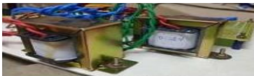
Fig 7. Transformer

Many electronic gadgets and appliances support low level voltage. In primary case, a stepdown transformer is used to level down high AC power. A step-down transformer takes 230V AC as input and drops it to 12V AC at the output, as shown in figure 7. It works by using a secondary coil with fewer turns than the primary one, creating a turns ratio that safely reduces the voltage (basic principle of working of a stepdown transformer). This provides a reliable, lower voltage perfect for running electronics,