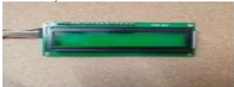
Fig 6. Liquid Crystal Display

The Figure 6 shows the Liquid Crystal Display LCD.