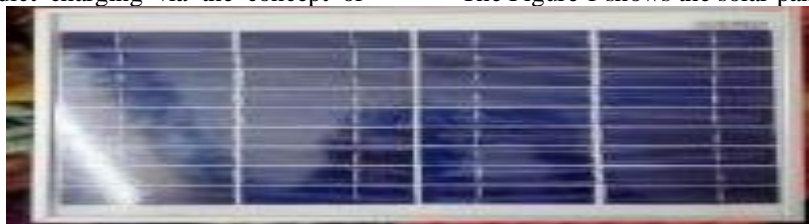
Fig1 . Solar Panel

The Figure 1 shows the solar panel. It uses polysilicon cells whose output power tolerance is \pm 3\% and a maximum power output of 10 Watts peak (Wp) (Figure 1). The conversion efficiency exceeds 20%, establishing it as an effective renewable energy source. Ideal voltage 17.6 volts and ideal current 0.57 amps, with short circuit current at 0.61 amps and open circuit voltage at 21.6 volts. The arrangement of 36 cells supports a standardized system voltage up to 1000 volts. Operation can be run between -40^{\circ}C to +85^{\circ}C , suiting diverse