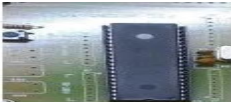
Fig 10. PIC16F877A

The Figure 10 shows the microcontroller PIC16F877A