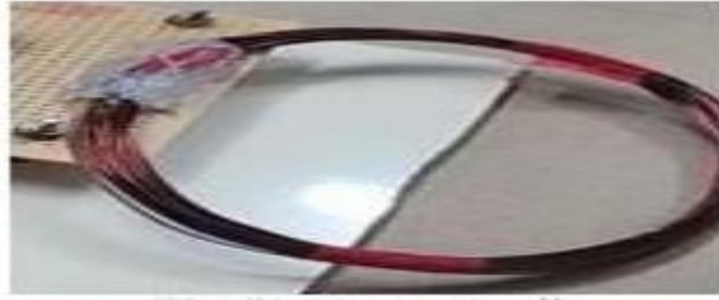
Fig 5. Coils

when you turn on the transmitter coil (the primary coil fig 5), it creates a changing magnetic field. This field radiates outward and powers the receiving coil (the secondary coil) nearby. The receiver then uses electromagnetic induction to generate an alternating current. That current is then converted to direct current that charges the EV's battery. This method