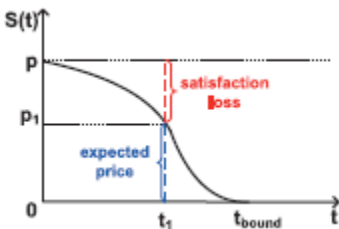
Fig. 2. Satisfaction function.

With the increase of downloading delay, the user's satisfaction decreases accordingly, the rate of which reflects the user's delay tolerance. To flexibly model users' delay tolerance, we introduce a satisfaction function S(t) , which is a monotonically decreasing function of delay t , and represents the price that the user is willing to pay for the data service with the delay. The satisfaction function is determined by the user himself, his requested data, and various environmental factors. We assume that each user has an upper bound of delay tolerance for each data. Once the delay reaches the bound, the user's satisfaction becomes zero, indicating that the user is not willing to pay for the data service. Figure 2 shows an example of the satisfaction function S(t) of a specific user for a specific data, where t_{bound} is the upper bound of the user's delay tolerance. p is the original charge for the data service, and the satisfaction curve represents the user's expected price for the data as the delay increases. For example, with delay t1 the user is only willing to pay p1 instead of p . p - p1 is the satisfaction loss caused by delay t1 .