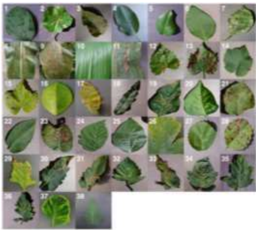
Figure 1: All the classes of plant disease present in the dataset

Automated computer-based identification and diagnosis based on plant disease symptoms may provide agricultural technicians and farmers with rapid and accurate disease information, thereby reducing dependency on farm technicians. Agricultural land in Bangladesh. Roughly 80% of people are directly or indirectly linked to agronomy. The economy of Bangladesh is heavily dependent on the agricultural sector and most of Bangladesh's economy is in this sector. The cultivation of crops and fruits for many years is changing our financial status. Many plants are planted across the country in Bangladesh and rice, wheat, and potato have affected the high level of popularity amongst all crops and fruits. Maize, peach, grape, and strawberry plantation is showing a growing trend, which is quickly strengthened by the invitation of this crop. Thus, farmers' interest in growing such crops and fruits is higher than the previous decline. The fish is very common and highly tested for vitamin A products. In the hemisphere of the northern and southern regions, fish grows at colder temperatures. Peach has been invented in China for the first time, since spreading Asia, Europe, Spain, Mexico, and the US. The fruit tree size is very short of peach ( Prunus persica ). The peach farmer has suffered various diseases that have decreased the production rate of the peach and caused enormous losses. Several diseases are